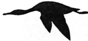
Common Loon in flight.

Loons eat mainly fish. Favoured prey are perch, suckers, bullheads, sunfish, smelt and minnows. When fish are few or not present, loons will eat frogs, salamanders, crayfish, snails, clams, leeches and aquatic plants. Loons capture their food underwater. Their legs are placed far back on their body making them very fast swimmers, but clumsy on land. The nest is usually located right next to the water, on a small island or on a mound of vegetation in a marsh. One or two eggs are laid, and the young leave the nest within a day of hatching.