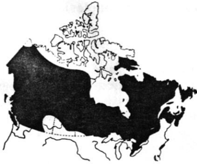
Breeding distribution of the Common Loon.

The Common Loon is larger than most ducks. Its dark head is large, and its bill is heavy and straight. A vertically shaped band marks the neck. The back is boldly speckled white on black, the breast is white, and the eyes are red. The loon's shape is quite similar to that of other ducks called mergansers, but the plumage of the Common Loon and its dark head identify it from other species.